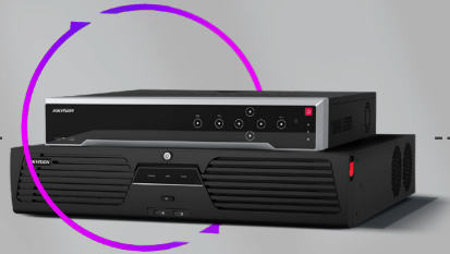
I/M NVRs: Records / Alarm DeepinMind: Target Search FW4.6.0