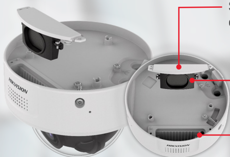
Sealing ring and plug at the cavity closure