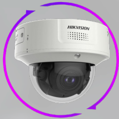
iDS-2CD71xx FW 5.8.10