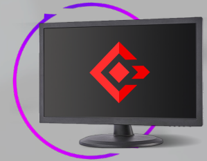
HikCentral Pro 2.3