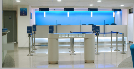
Banks & Financial Institutions