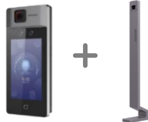
DS-K1T671TM-3XF + DS-KAB671-B (Optional)