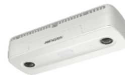
Dual-Lens People Counting Network Camera