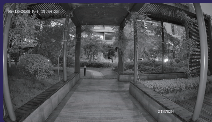
Smart hybrid light camera with ColorVu