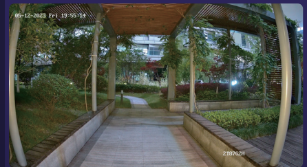
Smart hybrid light camera with ColorVu