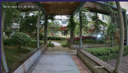
Smart hybrid light camera with ColorVu