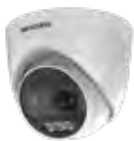
PIR siren turret camera DS-2CE72D0T-PIRXF