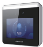
DS-K1T331 Face Recognition Terminal