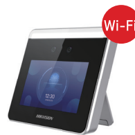
DS-K1T331W Face Recognition Terminal