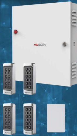
Access Control Kits