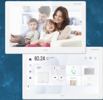
Video Intercom Indoor Station