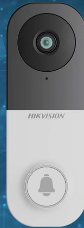
Wi-Fi Smart Doorbell